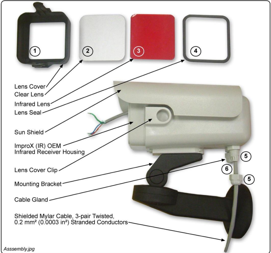
Figure 2: Assembly Sequence

Figure 2 and Figure 3 show assembly and connection diagrams for the Receiver.