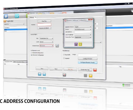
BIOMETRIC ADDRESS CONFIGURATION