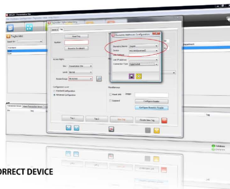
SELECT CORRECT DEVICE